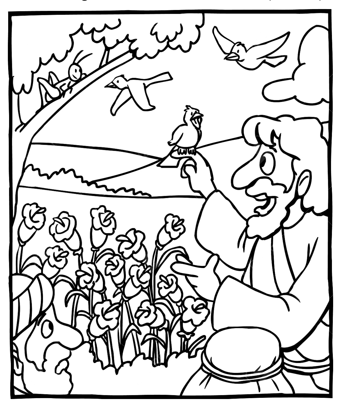
Transfiguration of Our Lord | 2 Mar 2025 "Learn from the Birds" Luke 12:1—13:9

"for Healing, Obedience, & Peace on Earth" (H.O.P.E.)